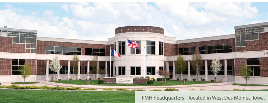
FMH headquarters - located in West Des Moines, Iowa.

6785 Westown Parkway | West Des Moines, IA 50266 | Toll Free: 800.247.5248 | www.fmh.com